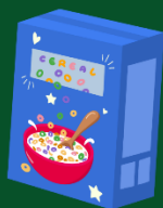
Cereals, pasta, rice