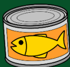
Tinned meat or fish