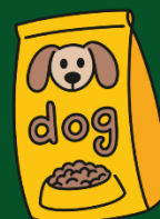
Dog and cat food