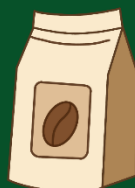
Tea, coffee, sugar